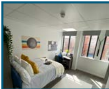
Standard En-Suite Room

* Please note that these rooms are limited and are offered on a first come first served basis. In light of the configuration of the building these rooms do vary in size.