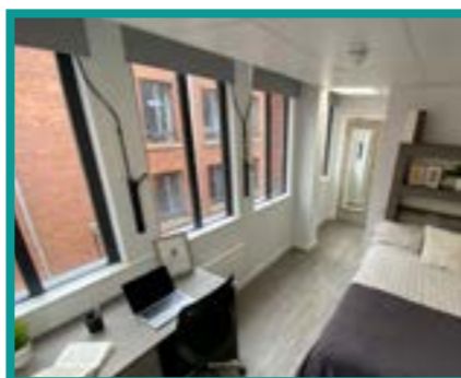
Deluxe En-Suite Room